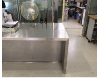
Accessible public information/service counter